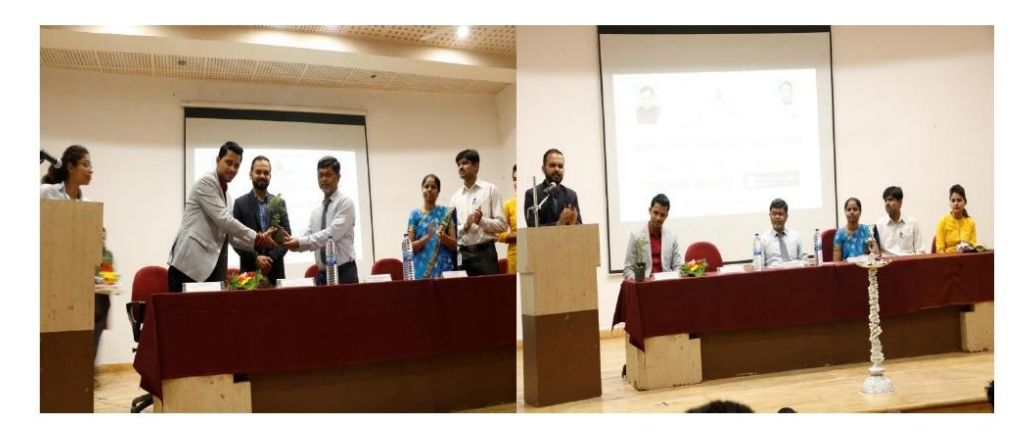
Inaugural Function of 3 days Workshop and Microsoft Certification on Network Security