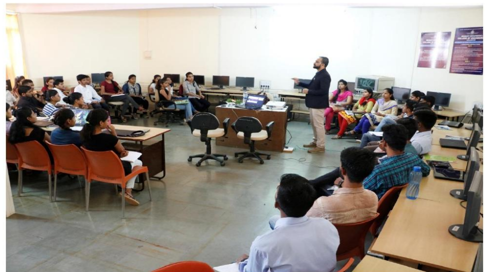
Microsoft Certification on Network Security